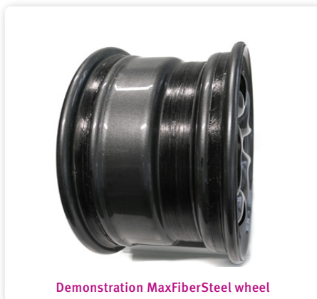
Demonstration MaxFiberSteel wheel

A demonstration vehicle door panel made by JLR from carbon fiber-reinforced PA410, as well as fabric sheets woven from the same UD tape (EU-sponsored ENLIGHT project). The UD tape products were thermo-formed and glued to make the panel, which is 60% lighter than state-of-the-art, steel-based designs, while still fulfilling safety requirements. The full composite door consists of structural panels and a tape-wound side impact beam over an extruded, permanent mandrel.