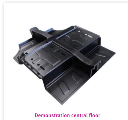
Demonstration central floor

Maxion Wheels and DSM successfully manufactured and tested (Rim Rolling Fatigue) thin-walled hybrid, steel-composite automotive wheel-rim reinforced with UD tape (tape-winding) made from glass fiber-reinforced PA410. The hybrid wheel-rim is 2Kg lighter and 30% more fatigue-resistant than state-of-the-art, steel design, whilst inert to road salts and battery acids.